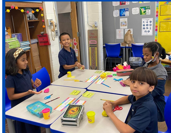
Winthrop School celebrated National Play-Doh Day

SEPTEMBER IS ATTENDANCE AWARENESS MONTH #SchoolEveryDay