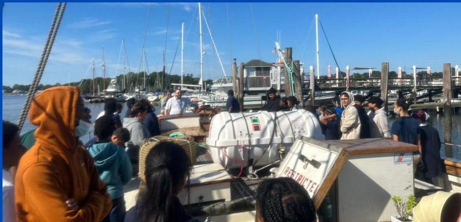
Thomas Hooker School's 7th & 8th Graders took a Field Trip to Amistad