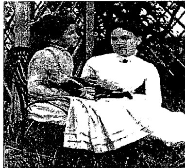
Helen and Annie together

Soon Helen's parents realized that she needed some special help. They contacted the Perkins Institute for the Blind in Boston. The director suggested a former student named Annie Sullivan. Annie had been blind, but had her eyesight restored by surgery. Perhaps her unique experience would allow her to help Helen. Annie came to work with Helen on March 3, 1887 and would be her helper and companion for the next 50 years.